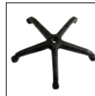
Aluminium die cast base