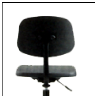
Black powder coated back stem