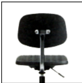
Chrome back stem.