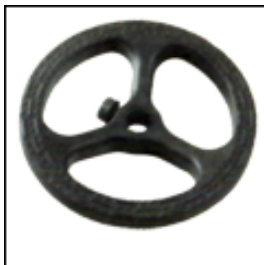
Heavy duty Thermoplastic footing or Chrome steel footing c/w Black Aluminium Die Cast Support.