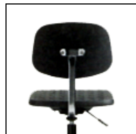
Chrome back stem