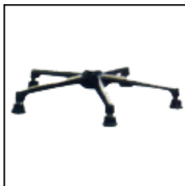
Aluminium Die Cast base on nylon or PU wheel castors. Nylon castors are suitable for carpet and vinyl floor. PU castors are suitable for cement and wooden.