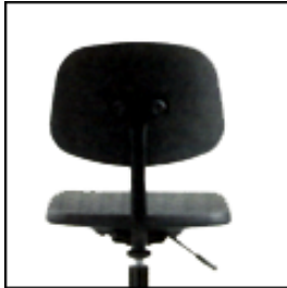
Black powder coated back stem.