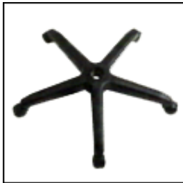
Heavy Duty 5 Prong Thermoplastic base on nylon or PU wheel castors. Nylon castors are suitable for carpet and vinyl floor. PU castors are suitable for cement and wooden floor.